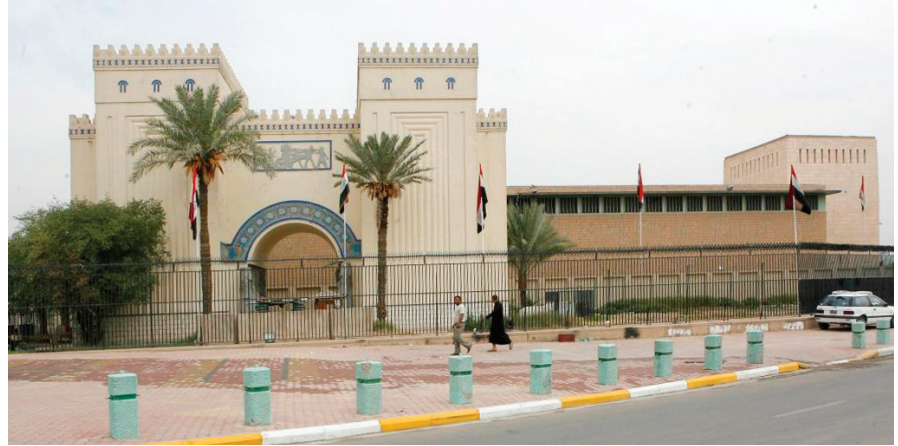
Iraq National Museum.

GD: I was fortunate to be chosen to be the adviser to the government of the Kingdom of Bahrain in charge of coordinating the building of the new $40 million National Museum. It became such a challenging role that I spent 10 years in Bahrain opening new exhibits and training staff. The National