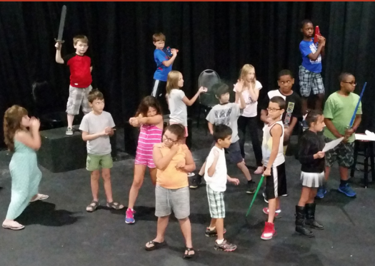
Rehearsal of "Star Wars" at The Aurora Fox Arts Center

Over the summer, our different programs in the Cultural Services Division offered engaging, fun yet challenging children's camps.