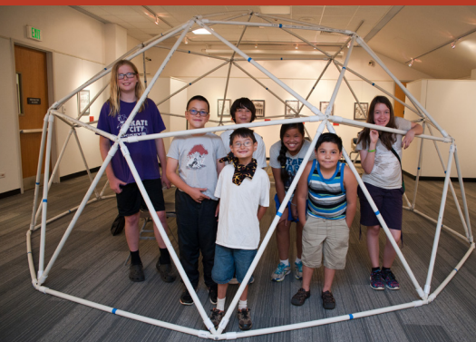
Building a replica of Buckley Air Force Base "golf balls" at the Aurora History Museum