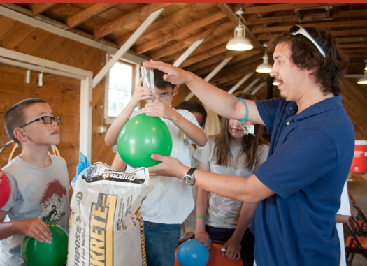
Creating a parachute at DeLaney Farm historic farm